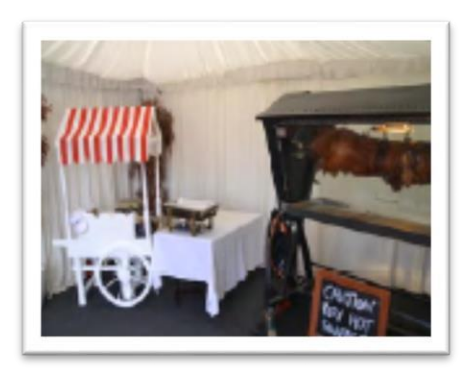
Choose from a variety of flavours – ask your wedding co-ordinator for available flavours